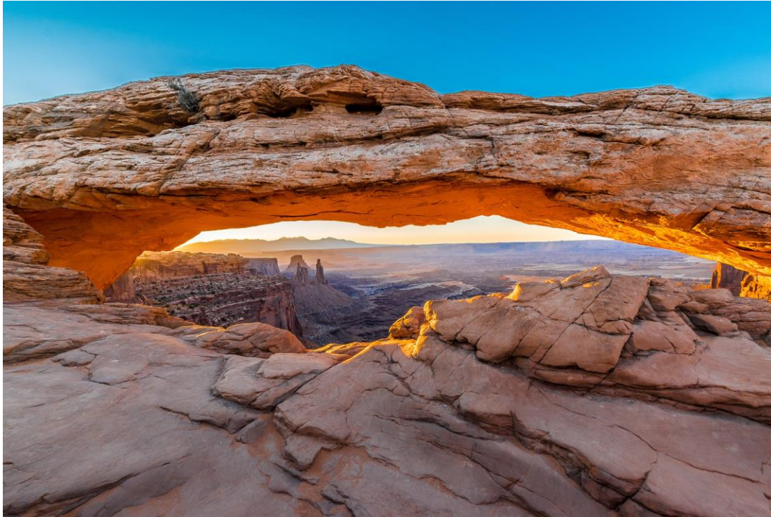
Canyonlands National Park, Utah.