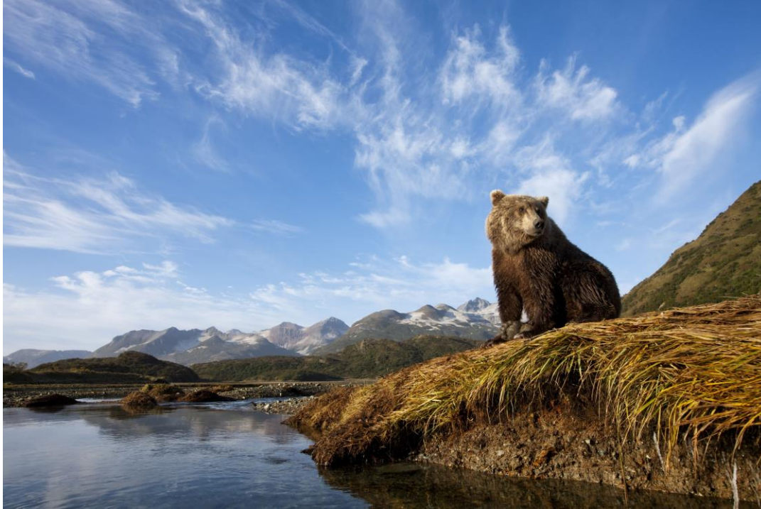
Coastal Brown Bear, Katmai National Park, Alaska.