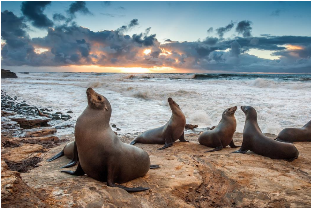
Sea Lions at sunset, San Diego, California.

This content is developed from sources believed to be providing accurate information. The information in this material is not intended as tax or legal advice. Please consult legal or tax professionals for specific information regarding your individual situation. This material was developed and produced by FMG Suite to provide information on a topic that may be of interest. FMG is not affiliated with the named representative, broker-dealer, or state- or SEC-registered investment advisory firm. The opinions expressed and material provided are for general information, and should not be considered a solicitation for the purchase or sale of any security. Copyright 2021 FMG Suite.